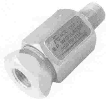
INLET 1/4" FPT

PO Box 935, Stinson Beach, CA. 94970; (415) 453 8157