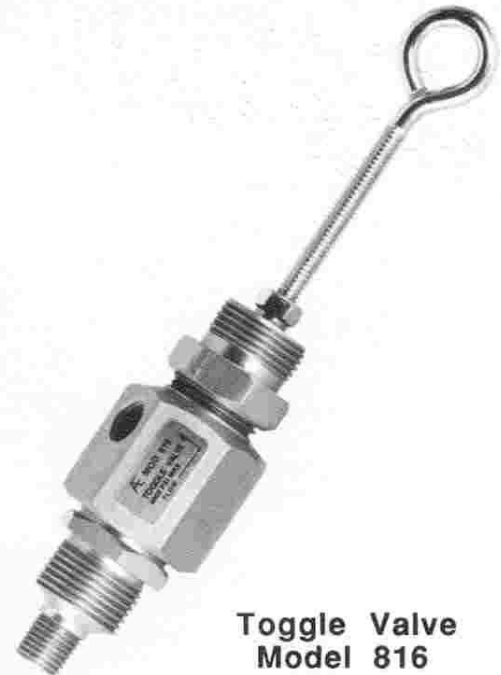
Toggle Valve Model 816