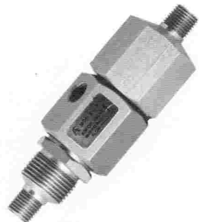
Air Operated Valve Model 816-1